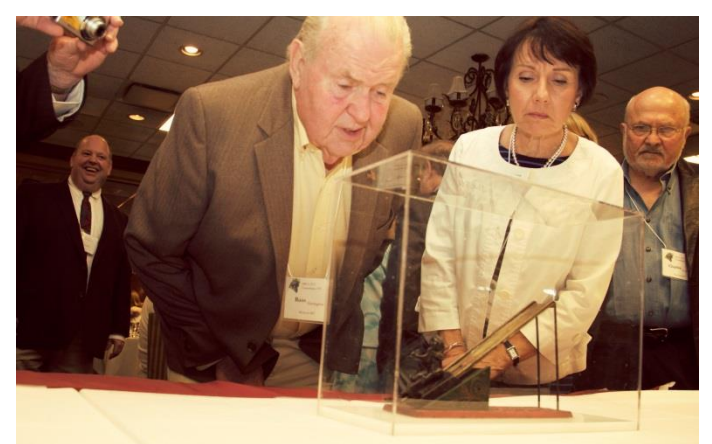
Collectors take a closer look during an unveiling at the annual Mechanical Bank Collectors of America banquet.